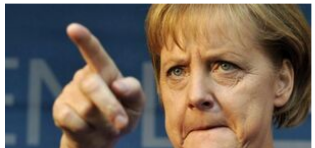
Angela Merkel as German Chancellor stated that "the pandemic is not over until all people in the world have been vaccinated"