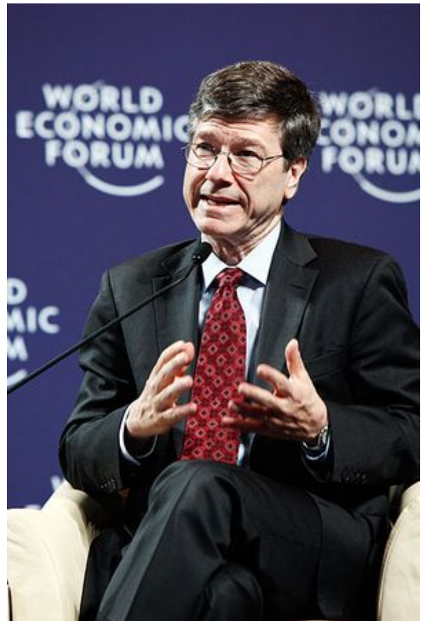
Jeffrey Sachs, who was made chair of the Lancet Commission on COVID-19 after Peter Daszak recused himself