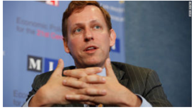
Peter Thiel, Co-founder and largest shareholder of Palantir, which is heavily involved in crunching COVID data

Jutta Urpilainen (3 February 2021) [111]