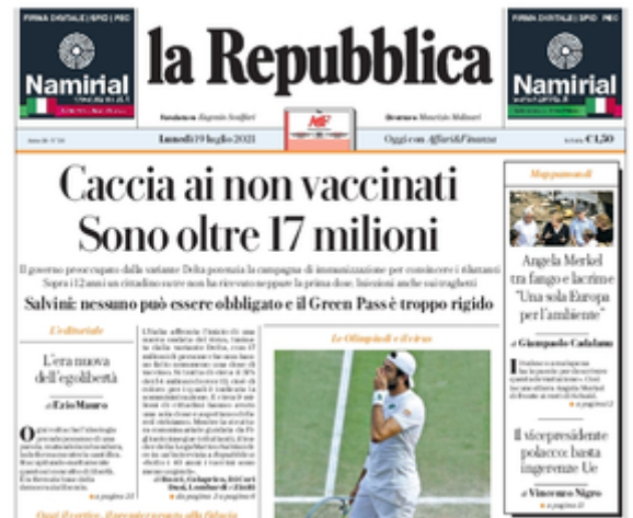
"Hunt for the non-vaccinated. There are 17 million more" on the front page of Maurizio Molinari's Repubblica

Full article: COVID-19/Vaccine/Mandation