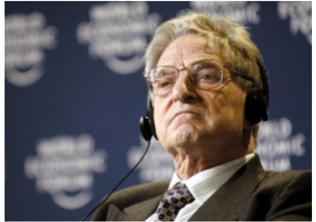
George Soros, of The Good Club, is suspected to have been controlling the narrative through groups such as BLM