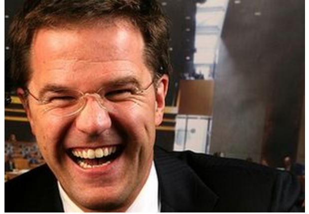
Mark Rutte, six time Bilderberg visitor, as Dutch PM fired his Economic Affairs Minister, Mona Keijzer, shortly after she publicly criticised the Dutch Vaccine passport. [152]