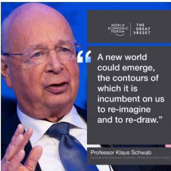
Klaus Schwab, ex-Bilderberg Steering Committee

The Great Reset is an SDS attempt to reframe of economic inequality in a positive light: "You'll own nothing, and you'll be happy". COVID-19 has greatly increased economic inequality as small and medium enterprise have been forced under while unprecedented peacetime increases in the money supply and corporate welfare have been doled out to a few large organisations.