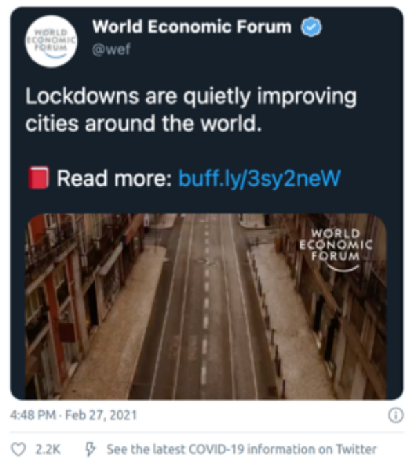
A WEF tweet which was quickly deleted after it raised criticism.