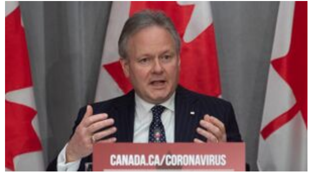
Stephen Poloz speaking in March 2020. [199]

France's Prime Minister Jean Castex chose the French Covid debt commission to "steer the nation's deliberations on the future of public finances in the aftermath of the pandemic." He is not known to have attended the Bilderberg, but 3 of his 10 commissioners have: [204]