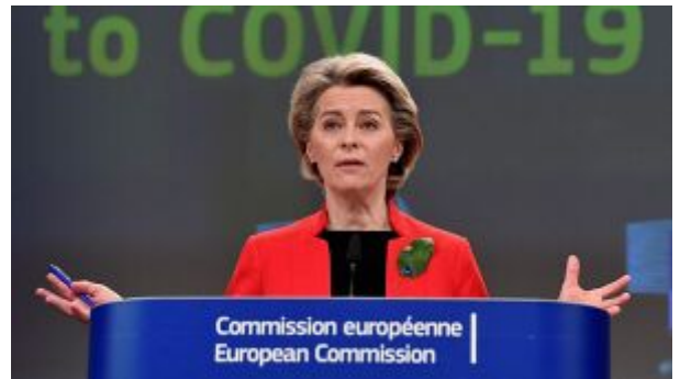
Ursula von der Leyen, a figure of great importance in COVID-19 event