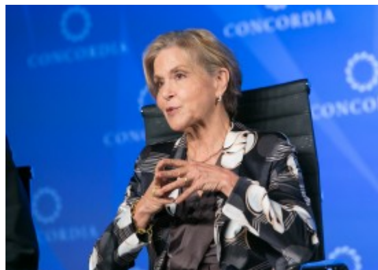
Judith Rodin took part in the 2010 Lock Step exercise about using a pandemic to usher in high tech totalitarianism

In Spring 2020, many nation states formed COVID-19 Task Forces , many of which had, or acted as if they had, " state of emergency " powers to override standard operating procedure .