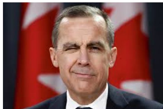
Mark Carney, Tri-national, quad-Bilderberger, Governor of the Bank of England until March 2020, when he became an "informal adviser" to Prime Minister Justin Trudeau